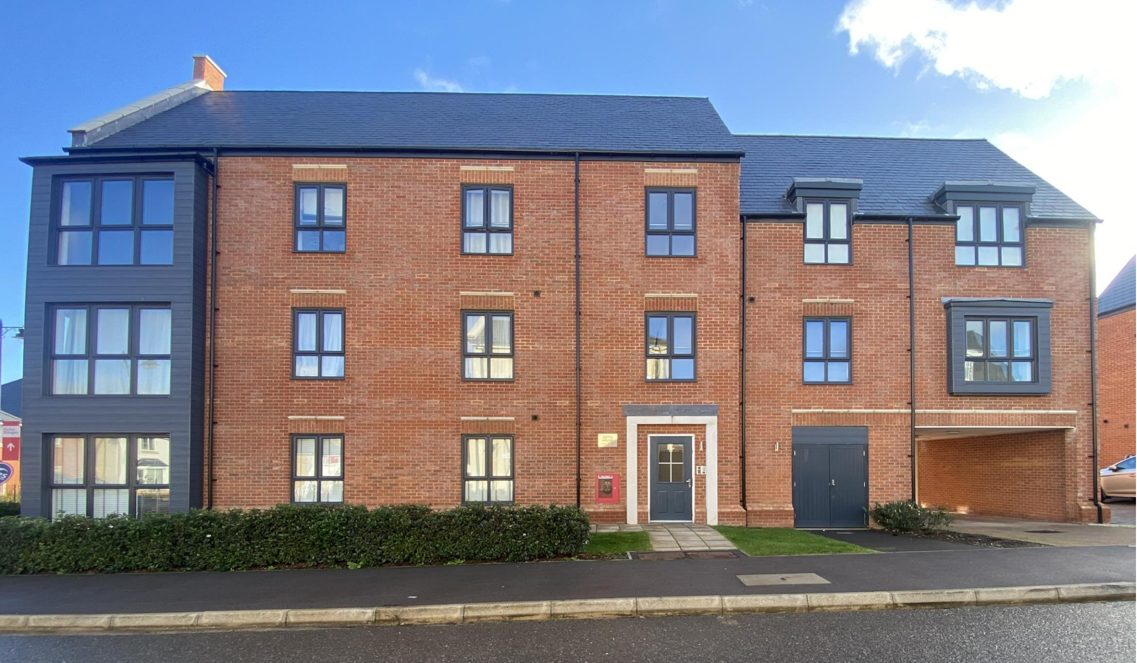
8 Betts House, 18 Fire Station Road, Wellesley, GU11 4ER